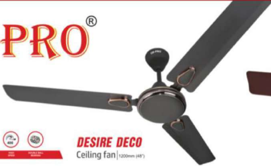
DESIRE DECO Ceiling fan | 1200mm (48")