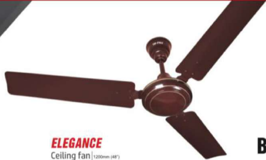
ELEGANCE Ceiling fan | 1200mm (48")