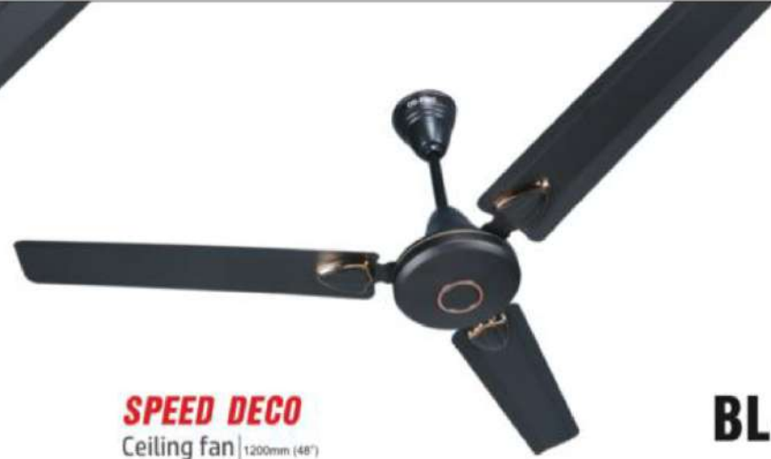
SPEED DECO Ceiling fan | 1200mm (48")