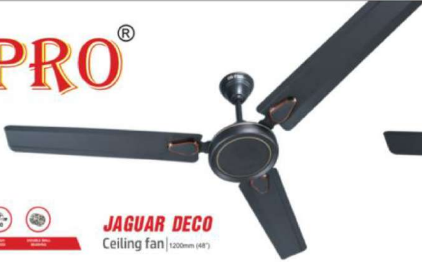
JAGUAR DECO Ceiling fan | 1200mm (48")